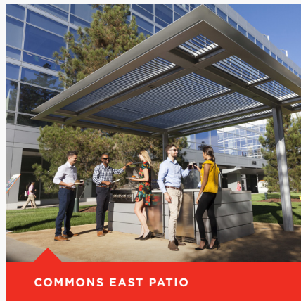
COMMONS EAST PATIO