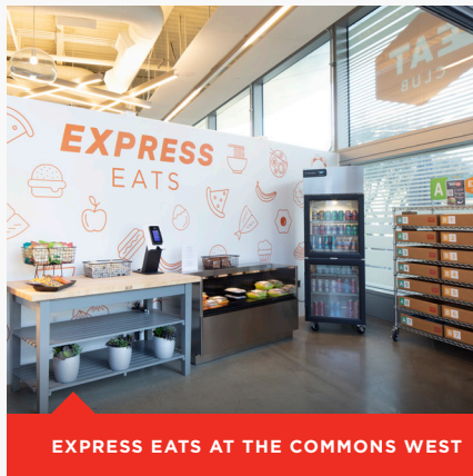
EXPRESS EATS AT THE COMMONS WEST