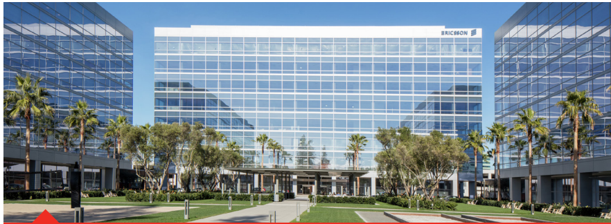
YOUR WORKPLACE COMMUNITY