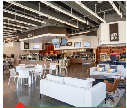
THE KITCHEN @ COMMONS EAST

Contemporary on-site conveniences and an unbeatable Santa Clara location make Santa Clara Square the ultimate place to work.