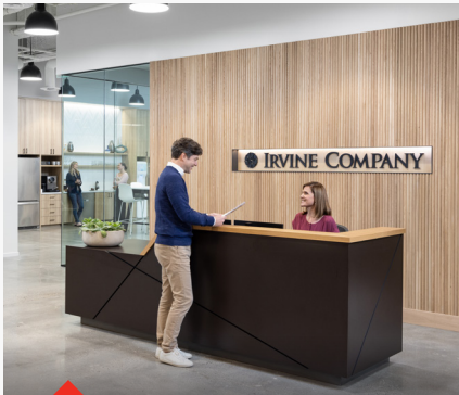
CUSTOMER RESOURCE CENTER