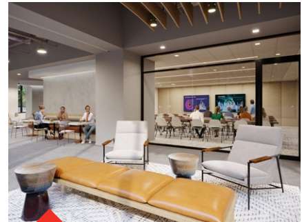
VENUE MEETINGS & EVENTS