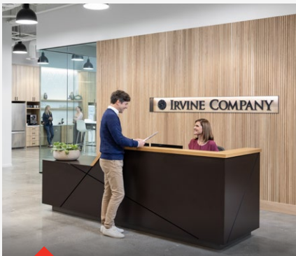
CUSTOMER RESOURCE CENTER