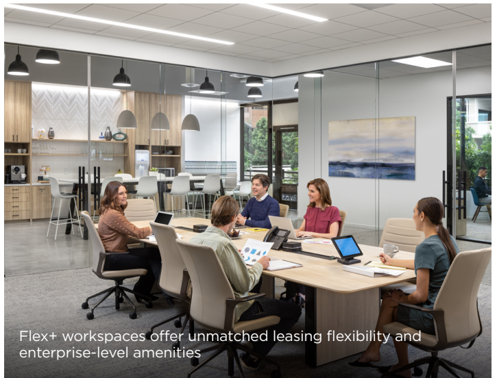
Flex+ workspaces offer unmatched leasing flexibility and enterprise-level amenities