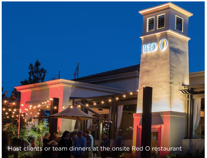
Host clients or team dinners at the onsite Red O restaurant