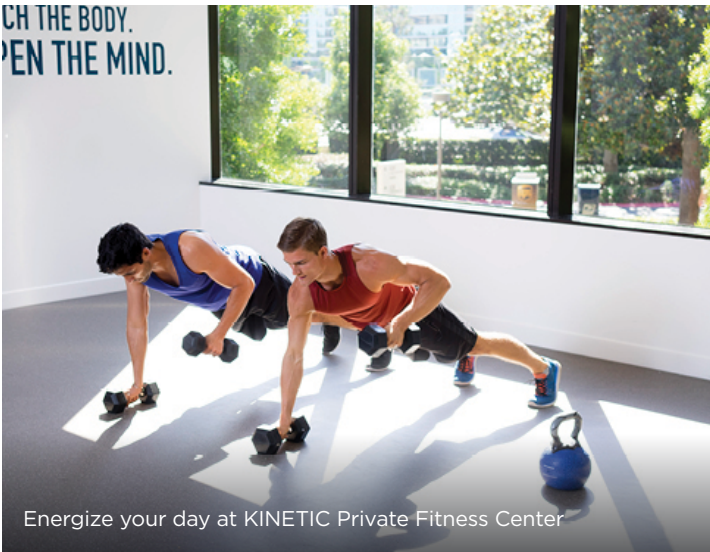
Energize your day at KINETIC Private Fitness Center