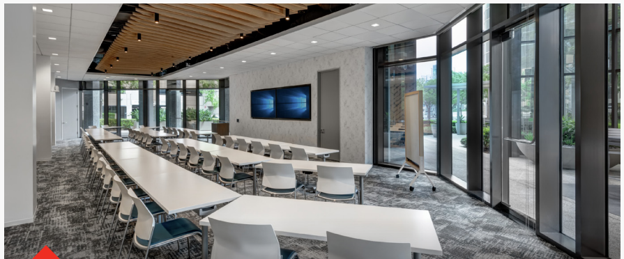
VENUE MEETINGS & EVENTS