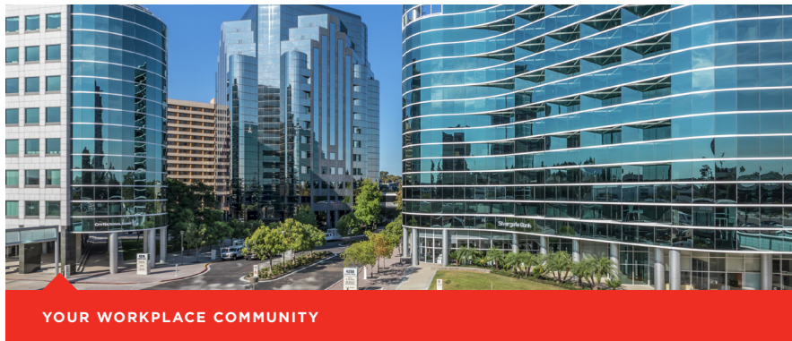
YOUR WORKPLACE COMMUNITY