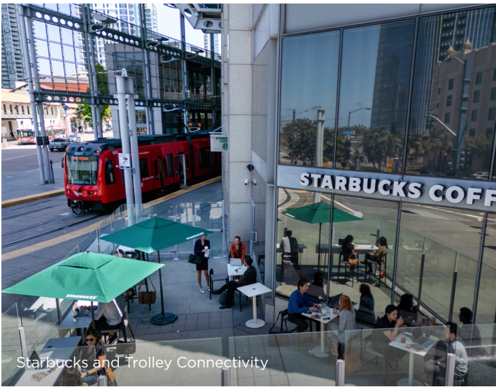
Starbucks and Trolley Connectivity