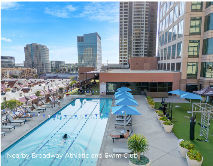
Nearby Broadway Athletic and Swim Club