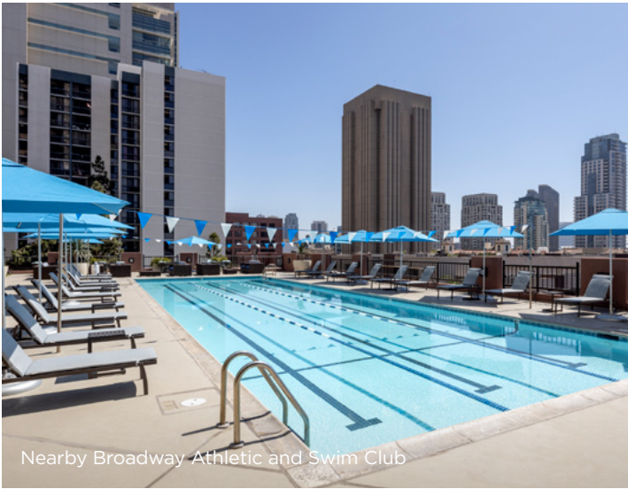
Nearby Broadway Athletic and Swim Club