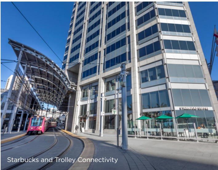
Starbucks and Trolley Connectivity