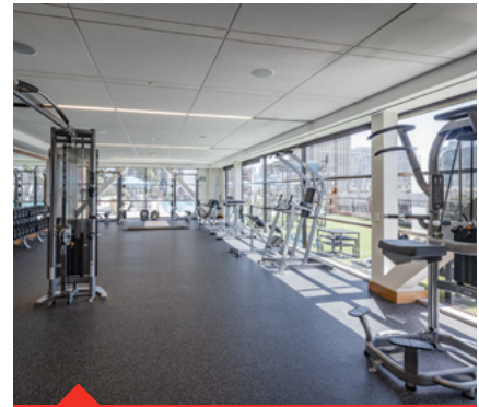
BROADWAY ATHLETIC AND SWIM CLUB

An office at 501 West Broadway makes the height of excellence your team's daily experience.