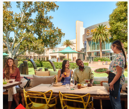
IRVINE SPECTRUM CENTER®