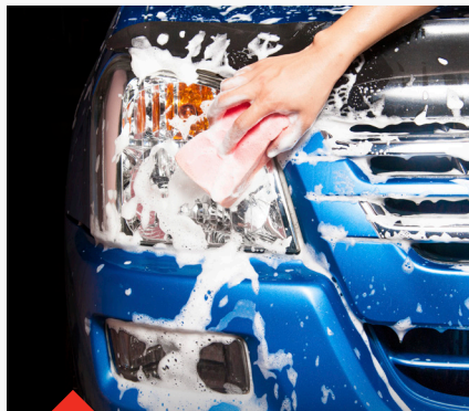
5 STAR CAR WASH