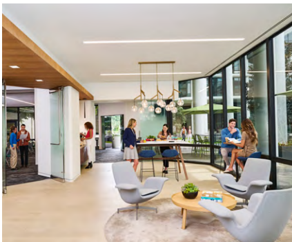
VENUE MEETINGS & EVENTS