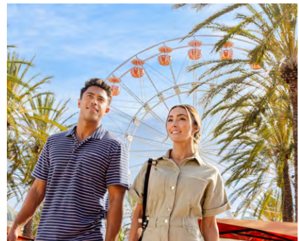
IRVINE SPECTRUM CENTER®