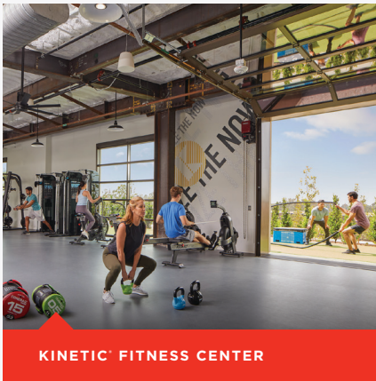
KINETIC® FITNESS CENTER