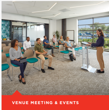
VENUE MEETING & EVENTS