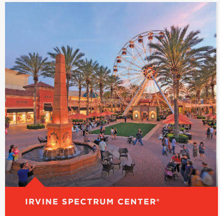
IRVINE SPECTRUM CENTER®