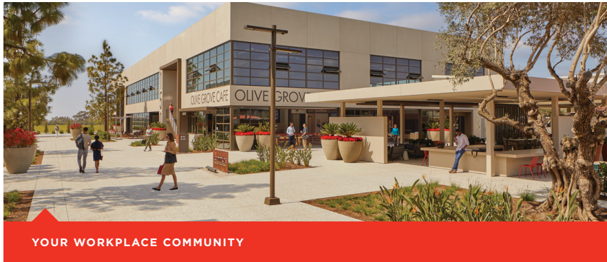
YOUR WORKPLACE COMMUNITY

This creative, open-air office village delivers distinctive amenities along a central pedestrian pathline with indoor/outdoor connections.