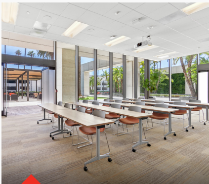
VENUE MEETINGS & EVENTS